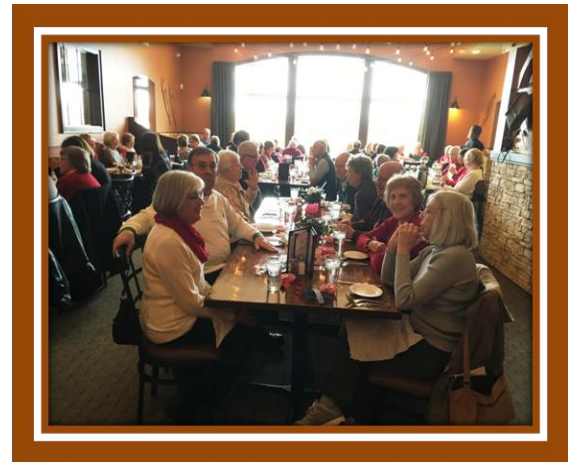
Enjoying Social Hour before the Valentine Luncheon and Entertainment.