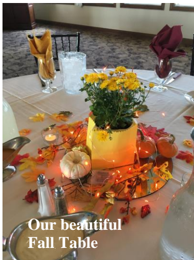
Our beautiful Fall Table