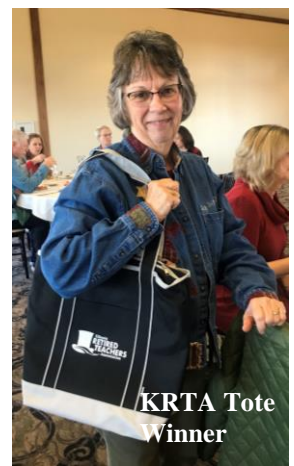
KRTA Tote Winner