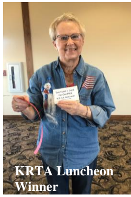
KRTA Luncheon Winner