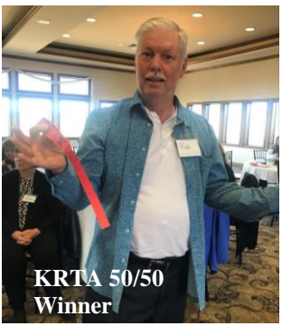
KRTA 50/50 Winner