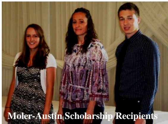
Moler-Austin Scholarship Recipients