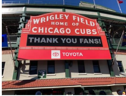
We have arrived