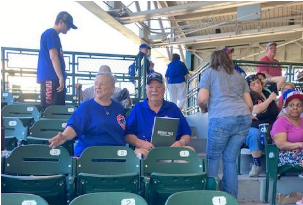
Our legislative leader ready for the game to begin.