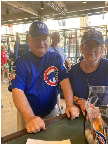
Our fearless leader taking care of business. His assistant is always there to help.