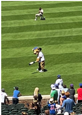
Fun with the Mascot.