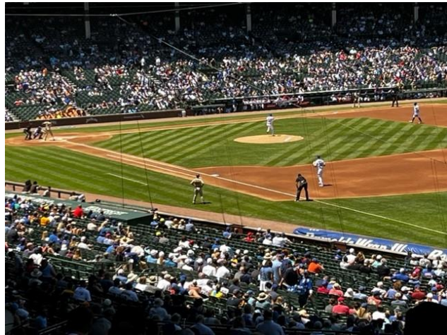
Batter Up Let the fun begin